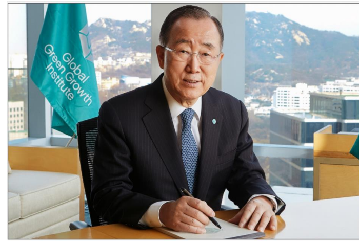
The President of the Assembly and Chair of the Council